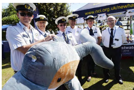
NCI Newhaven at the Fish Festival

This was the first of many events held throughout the year to celebrate the first quarter century of the charity. 25th Anniversary celebrations were held both nationally and locally at stations including fetes, garden parties, fairs open days and of course the NCI exhibition trailer attended several major boat shows.