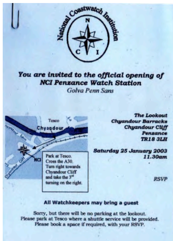
NCI Penzance was officially opened on 25 th January 2003

Returning to 2002, a meeting had taken place at the Queens Hotel, Penzance where it had been decided to try and establish an NCI lookout in the derelict Gunnery Observation Tower at Chyandour, behind Penzance railway station, overlooking Mounts Bay, Penzance Harbour and the beaches at Marazion. After negotiating the lease from the Ministry of Defence, NCI Penzance station opened for watchkeeping later in 2002.