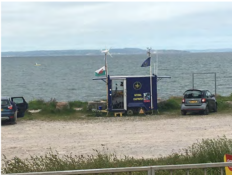
NCI Great Orme reopened on their new site in August 2020

On 10 th August 2019 NCI expanded its coverage of the Welsh coastline with the opening of NCI Great Orme in North Wales. Housed in an NCI mobile transportable unit situated in the car park of the 'Rest and be Thankful' café on the Great Orme overlooking Llandudno, the station initially only operated at weekends but gradually increased the number of watches as volunteers were recruited and trained. However, the view from the Great Orme was restricted and, following discussions with the Harbour Master, RNLI and HM Coastguard, it was agreed that the station would relocate to a location on the West Shore in Llandudno.