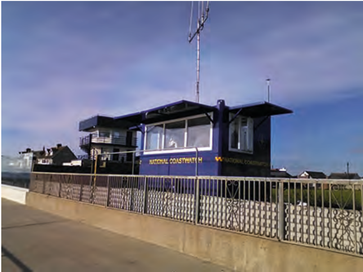
NCI Skegness in its latest incarnation

NCI celebrated its 20th Anniversary with a lunch at RNAS Cudrose on 28th June. Some 40 members of the NCI were joined by the Chairman of Cornwall Council, members of HM Coastguard Falmouth, HM Coastguard Cliff Rescue Teams from Mullion and Porthoustock and the UK Border Force.