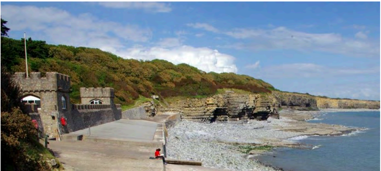
Once refurbished and kitted out, this will be the home of NCI St Donat's Bay

At the same time NCI St Donat's Bay began standing training watches in the grounds of the UWC Atlantic College in South Wales. The idea of a NCI Coastwatch station at St Donats Bay had first been discussed in October 2019 when the charity was offered a watch station by the college as part of the Atlantic College Sea Front development project. Unfortunately, the project had been delayed by the Covid pandemic and work was still ongoing some 18 months later.