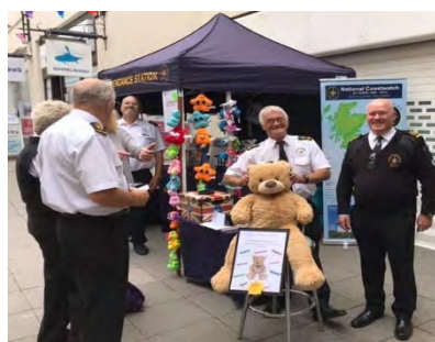
NCI Penzance at Golowan Fair