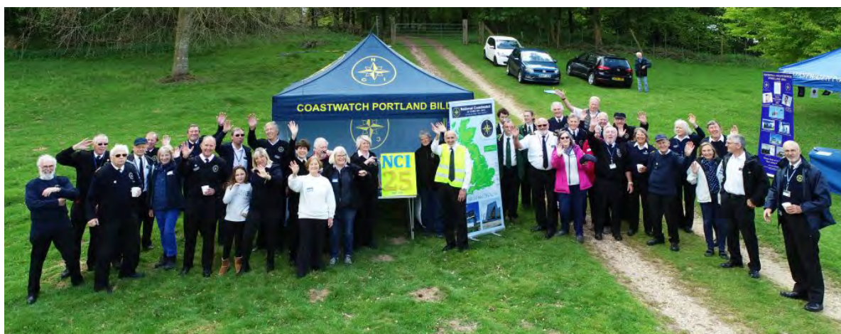
NCI Portland Bill held an open day at Charborough Park