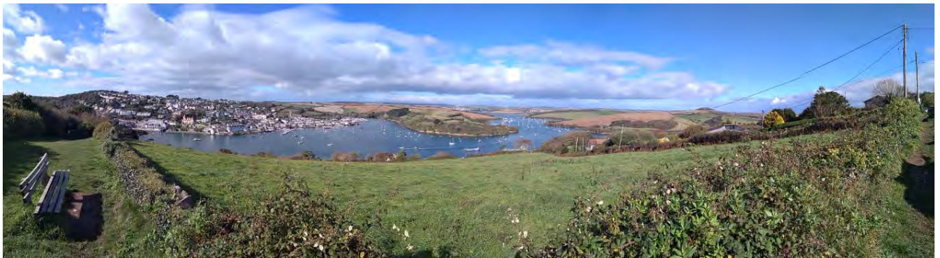
The view across Salcombe Harbour from NCI Froward Point

Later in 2005, the NCI opened a station in the disused Brownstone Battery at Froward Point. Built at the beginning of WWII, and decommissioned in 1956, this is one of the few coastal batteries which remain intact in this country. The site has been owned by the National Trust since 1982 and NCI Froward Point commenced watches from the old Battery Observation Post in 2005.